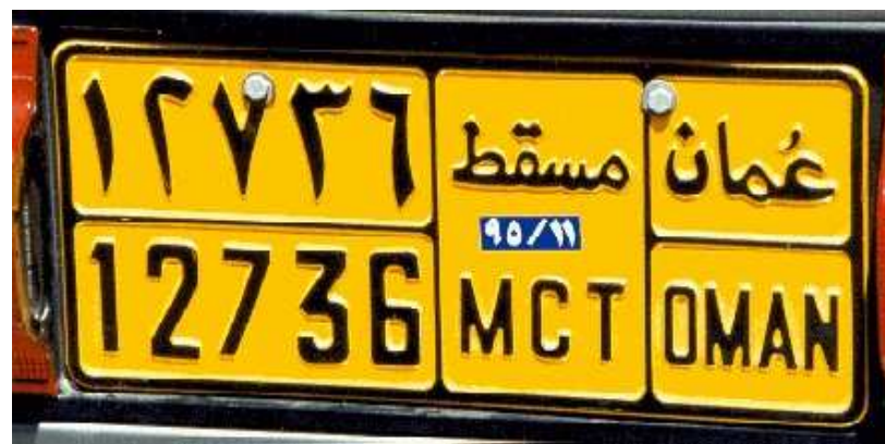
12736 : Pass plate from Musqat (exp. 11/95)

A : Musqat (Musqat) – B : Batinah (Suhar) – D : Dhakhiliya (Nizwa) – DH : Dhahira (Al Buraymi) – J : Junabiah {Dhofar} (Salalah) – M : Musandam (Al Khasab) – MCT : Capital area (Musqat) – SH : Sharqiya (Sur)