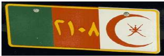
2108 : Diwan of the Royal Court, medical services