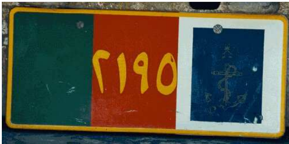
2195 : Official navy

Tous droits de reproduction : Vincent Moens (1998). Cet article a été publié dans Europlate Newsletter