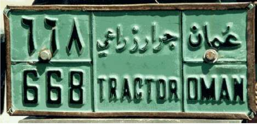
668 : agricultural vehicle

Agricultural vehicles have black on green plate in the same format than the general use plates but with the word TRACTOR in place of the district.