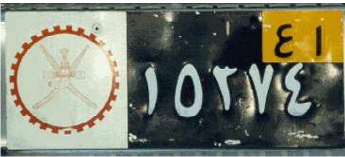
15374 – 41 : Royal engineers Corps

Heavy army vehicles have plates with green, red and green vertical bands, with a white Arabic serial number and a yellow border.