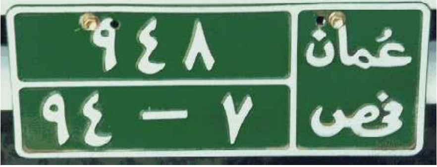
948 : Trade plate (Exp. 07/94)

Trade plates are white on green and dived in three : a serial number at upper left, a hyphenated number at lower left (Year – month of expiring) and "Oman" over "trade" at right, all in Arabic script.