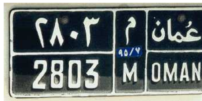
2803 : commercial vehicle from Musandam (exp. 07/95)

From 1986 motorcycle plates have been divided into three, wholly in Arabic script; the district code separated by a vertical line from "Oman" above a serial number. Privately owned motorcycles have black on yellow plates but it is not known if any other colors are used.