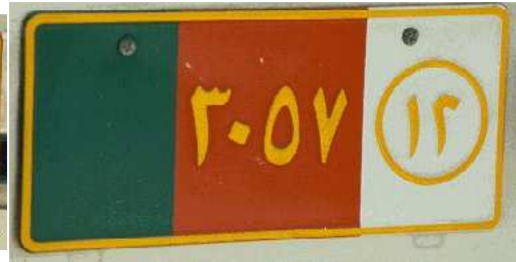
3057 : Diwan of the Royal Court