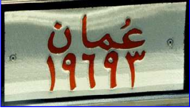
19693 : Government vehicle

Government and ministry vehicles have white plates with, in red, a serial number under "Oman", all in Arabic script.