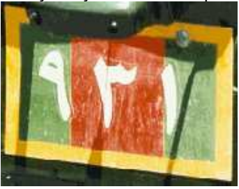
931 : Army heavy vehicle

Heavy army vehicles have plates with green, red and green vertical bands, with a white Arabic serial number and a yellow border.