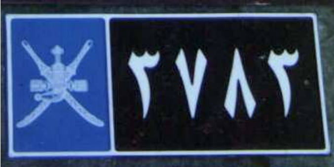
16399 : Air Force