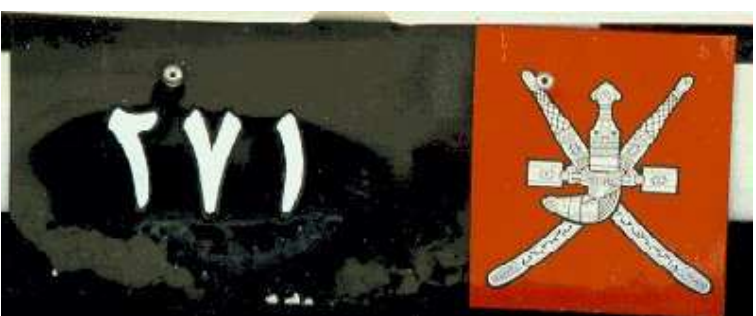
271 : Army

Military vehicles have black plates with a white Arabic serial number; this is prefixed or suffixed by a colored panel bearing a crossed swords device : White on Red : Army - White on Light blue : Air Force - White on Dark blue : Navy - Red on White : unknown (this plate also bears a small black yellow serial number at the upper right corner of the plate).