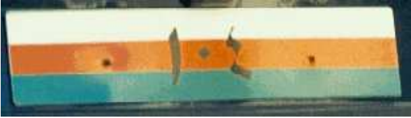
104 : Royal court affairs vehicles

Royal court affair vehicles have plates with white, red and green horizontal bands, with a black Arabic serial number.