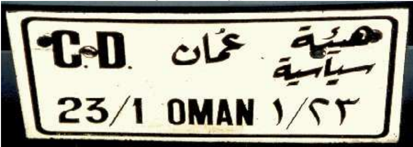
23/1 : Diplomatic vehicle

Diplomatic plates are colored white with black lettering : C.C. or C.D., "Oman" in Arabic, the consular corps or diplomatic corps in Arabic on the upper line, the registration in western characters, OMAN in western script and the registration in Arabic at the bottom. The registration consists of a number denoting the Embassy (details not known), an oblique stroke, and a serial number.