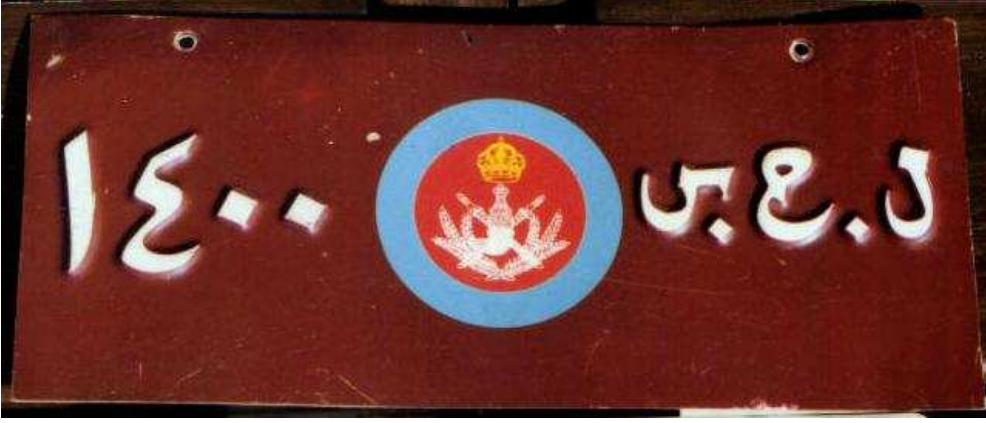
1698 : Royal guards vehicles

Royal Guards plates are in white on maroon with a serial number from 1000 to 9999, the royal court emblem in gold on maroon in a large green circle, and three letters, all in Arabic script.