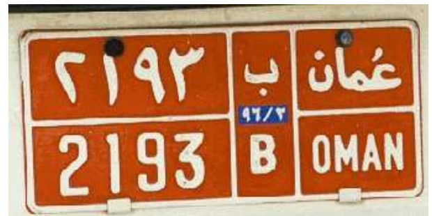
2193 : taxi from Batinah (exp. 02/96)