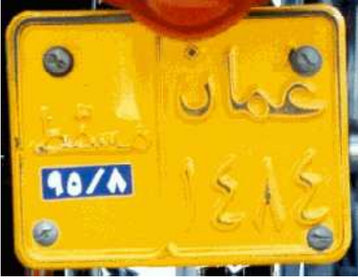
1484 : motorcycle from Musqat (exp. 08/95)

Agricultural vehicles have black on green plate in the same format than the general use plates but with the word TRACTOR in place of the district.