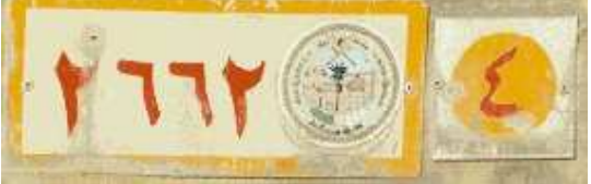
2662 : Muscat Municipality, 4th district (Road maintenance heavy vehicle)

Road maintenance heavy vehicles have white plates with red numbers and a colored shield of the ministry of transportation and a yellow border. They also have an additional white plate with a red number denoting the road in a yellow circle.