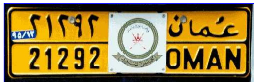
21292 : pass plate owned by members of Majlis Ashura "Consulative Conclil" (exp. 12/95)