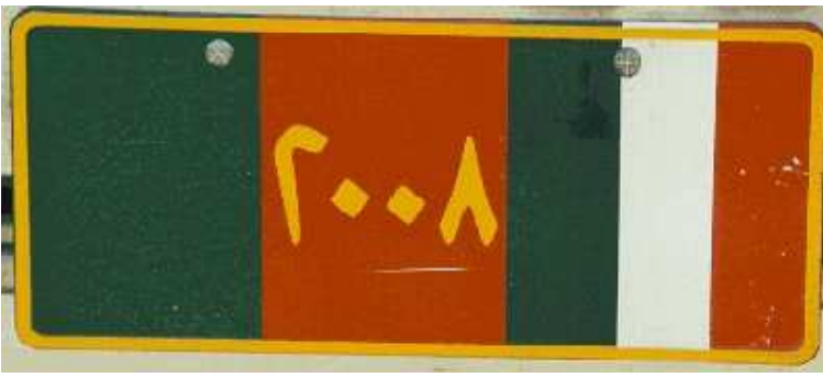
2008 : Diwan of the Royal Court

Government and military officials have plates with green, red and a third vertical bands, with a yellow Arabic serial number and a yellow border. The third band is bearing a special device : Three vertical bands of green, white and red colors : Type unknown - Yellow on white with two numbers in a circle : Type unknown - White with a red crescent and crossed swords : Ambulance - White with a green palm tree : Type unknown - Golden anchor on dark blue on white : Navy.