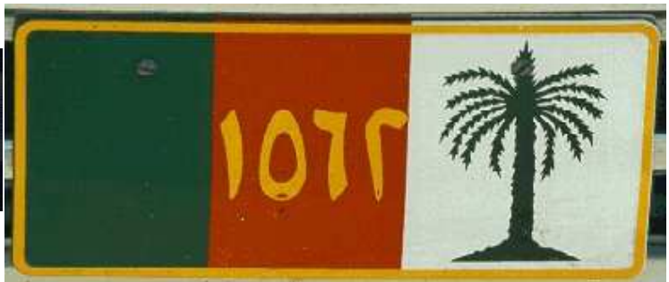
1562 : Diwan of the Royal Court, gardening services