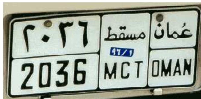
2036 : self-drive rental from Musqat (exp. 01/96)