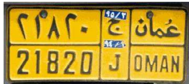
21820 : Pass plate from Junabiah (exp. 02/95)